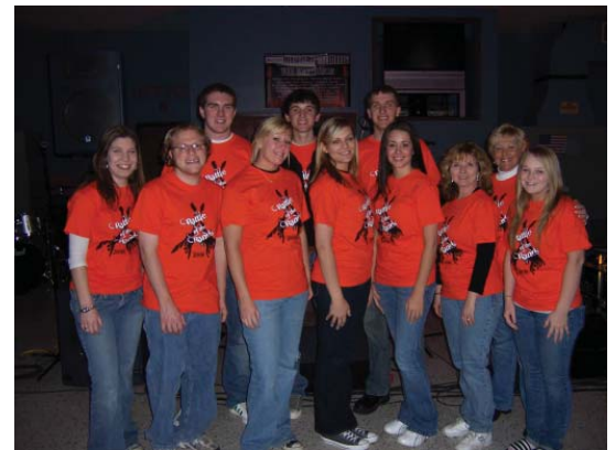
The 2007-2008 Young Adults Committee at their Battle of the Bands Fundraiser.

Our first committee meeting is Thursday, September 11 th at Alton High School. Thank-you to the students, the schools and the committee members for being committed to the Young Adults Committee.