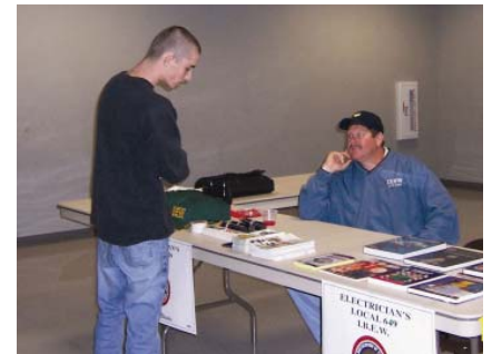
A student visits with a representative of the International Brotherhood of Electrical Workers Local 649 at a Trade Fair the Growth Association Education Committee organized. The committee is organizing an event for high school seniors that will include representatives from local businesses, trade unions and colleges.

The Growth Association is seeking volunteers to help with event planning and organization. Additionally, businesses will be asked to participate by providing professionals from their organizations to talk to students