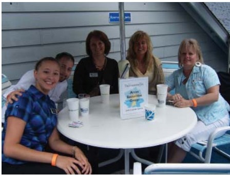
Alton Securities Group enjoyed their corporate sponsorship at the 2009 Duck Race at Raging Rivers Water Park in Grafton in May 2009.