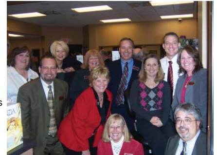
Thank-you to TheBANK of Edwardsville for hosting the January 2009 Business After Hours networking event.

February's Business After Hours host is Castelli's Moonlight at 255 on Thursday, February 19 th from 5-7. Join the Castelli Moonlight team and promote your business or organization and attend this BAH. Please rsvp to receptionist@growthassociation.com or call 618-467-2290.