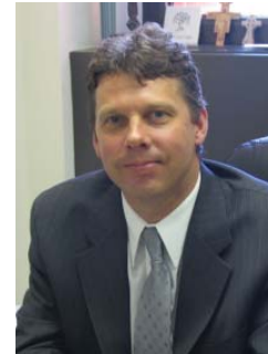
EJ Kuiper Saint Anthony's Health Center