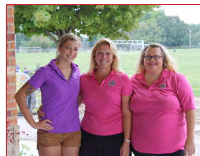
-Rolling Hills Golf Course -Spencer T. Olin Golf Course