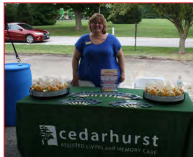
-Cedarhurst of Bethalto