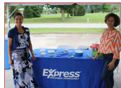
-Express Employment Professionals