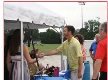
-Alton Parks & Recreation