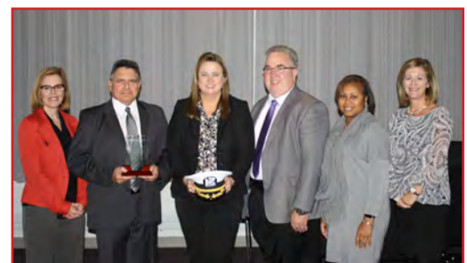
Alton Community Unit School District 11