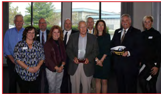
1st MidAmerica Credit Union