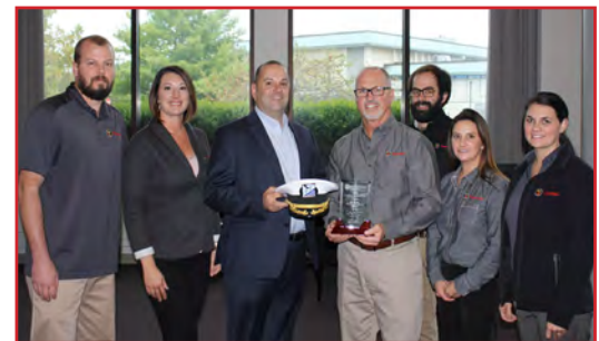
Imperial Manufacturing Group