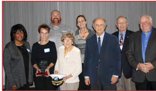
Lewis and Clark Community College