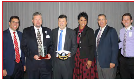
Alton Memorial Hospital