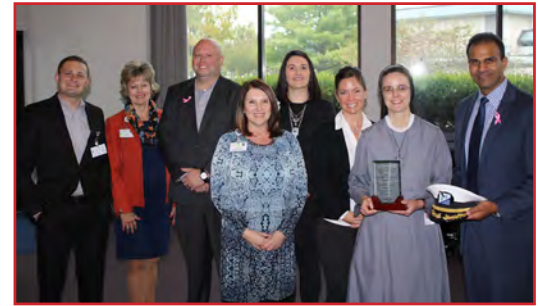
OSF Saint Anthony's Health Center